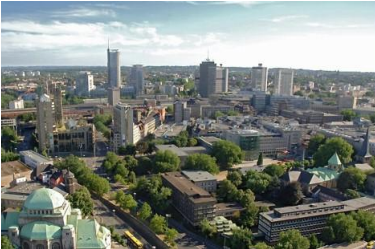
The City of Essen, Germany

The EAIR Essen Forum organisation is looking forward to see you all next year in Essen, Germany.